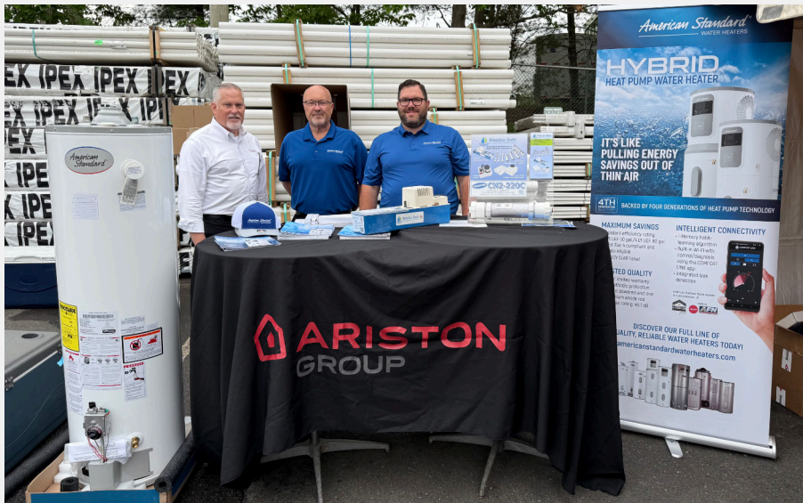
Your one-stop shop for all hot water solutions.

It was a fantastic day of connection, gratitude, and looking ahead to continued success—together.