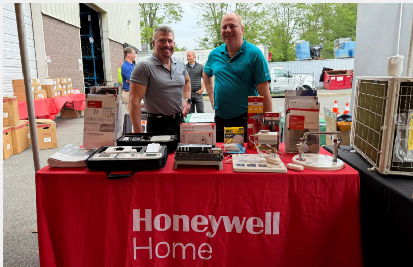
We have all the HVAC control solutions you need.