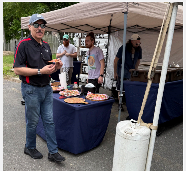
Savoring the best crispy pan pizza around.