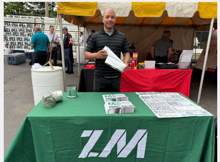
High quality sheet metal products.